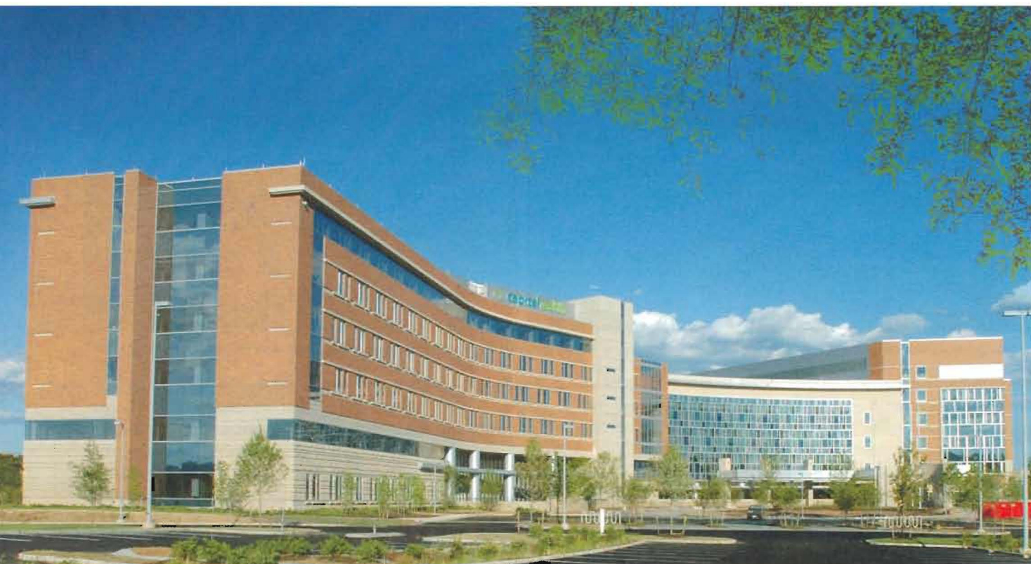
The new $530 million Capital Health Medical Center in Hopewell opens in November.

Part of the premise behind it is the notion that outpatient services will increase, serving a larger portion of those who come to Capital Health. Medical technology enables procedures to be much less invasive than they previously were. As a result, both the surgery and the recovery times are shorter and can be spread among the several hospitals that make up Capital Health's brand.