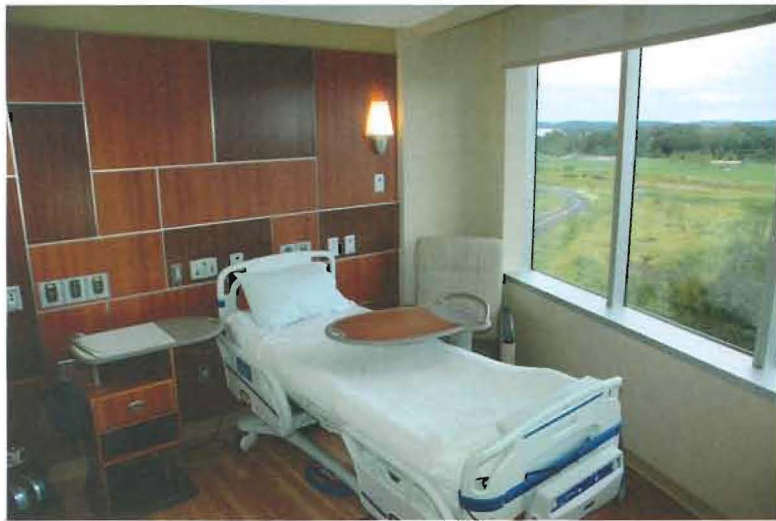
Capital Health Medical Center's patient room.