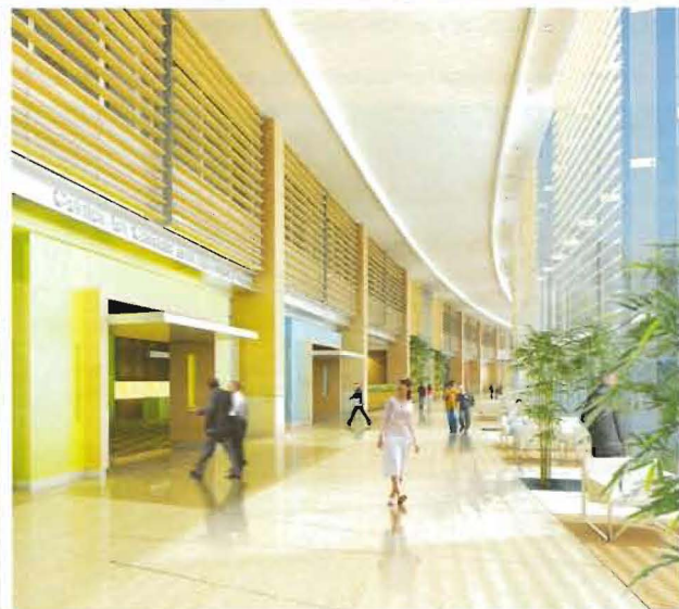
The new University Medical Center of Princeton at Plainsboro will feature 231 single-patient rooms and be built on a 171-acre campus. Renderings by HOK/RMJM Hillier.

very broad continuum of care that relates to that 85 percent of your needs, because we're defining your needs as keeping you healthy as well as helping you when you have a medical problem.